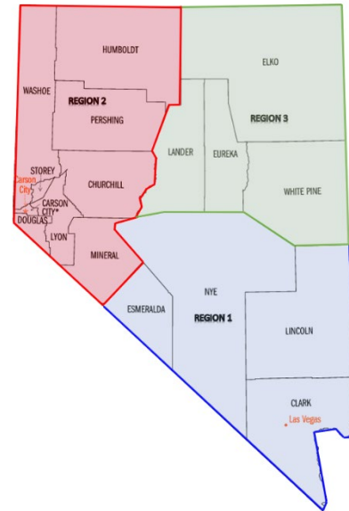
NEVADA REGION MAP

SOURCE: Nevada Division of Emergency Management (DEM), Nevada Department of Transportation (NDOT), Walker River Irrigation District, NV Energy, Nevada Department of Wildlife (NDOW), Lyon County Office of Emergency Management, and National Weather Service (NWS) Elko and Reno.